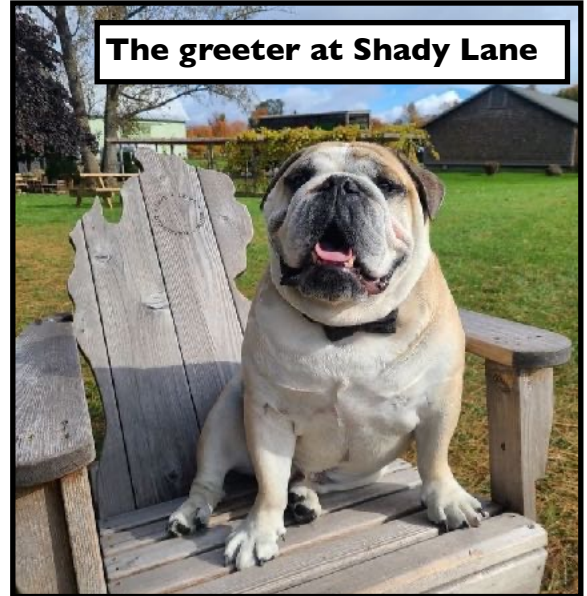
The greeter at Shady Lane

Wine is not the reason I went to Michigan, but, while there, why not try a little? I was especially interested in the Leelanau Peninsula in northern Michigan, in what I learned to call ‘the mitt’. Maybe you have been there. They call it Up North.