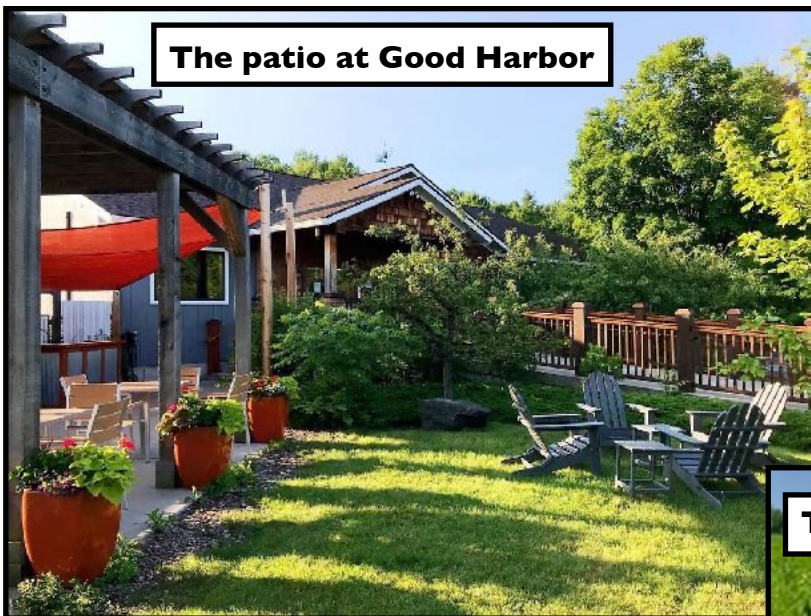
The patio at Good Harbor

The Leelanua Peninsula seems pretty far north, way up in northern Michigan. So I looked it up. It is on the 45th parallel, and if it makes you feel cold, remember, that’s the same parallel as Minneapolis. Seems cold. On the other hand, Walla Walla Washington, Bordeaux France, and Piedmont in Italy are also on the 45th parallel so why not grow grapes in Leelanua as well?