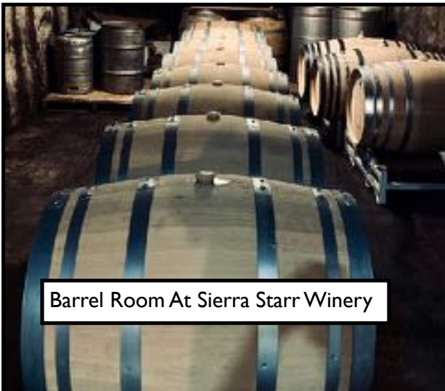
Barrel Room At Sierra Starr Winery

It is important to note that while there is plenty of parking available, it is all in the parking area. Not at the winery. There is a hill to walk up. If need requires, get dropped off at the top of the hill but then the car must return to the parking area at the bottom. So if you need to drop something off, okay. But the car still goes back.